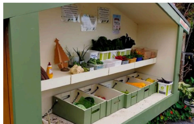
Cambridge Pātaka Kai

Are you interested in this fantastic idea and would you like to contribute to making this happen? If you are, get in touch. Share your thoughts with us on how to make this work, and let's cultivate a stronger sense of community together.